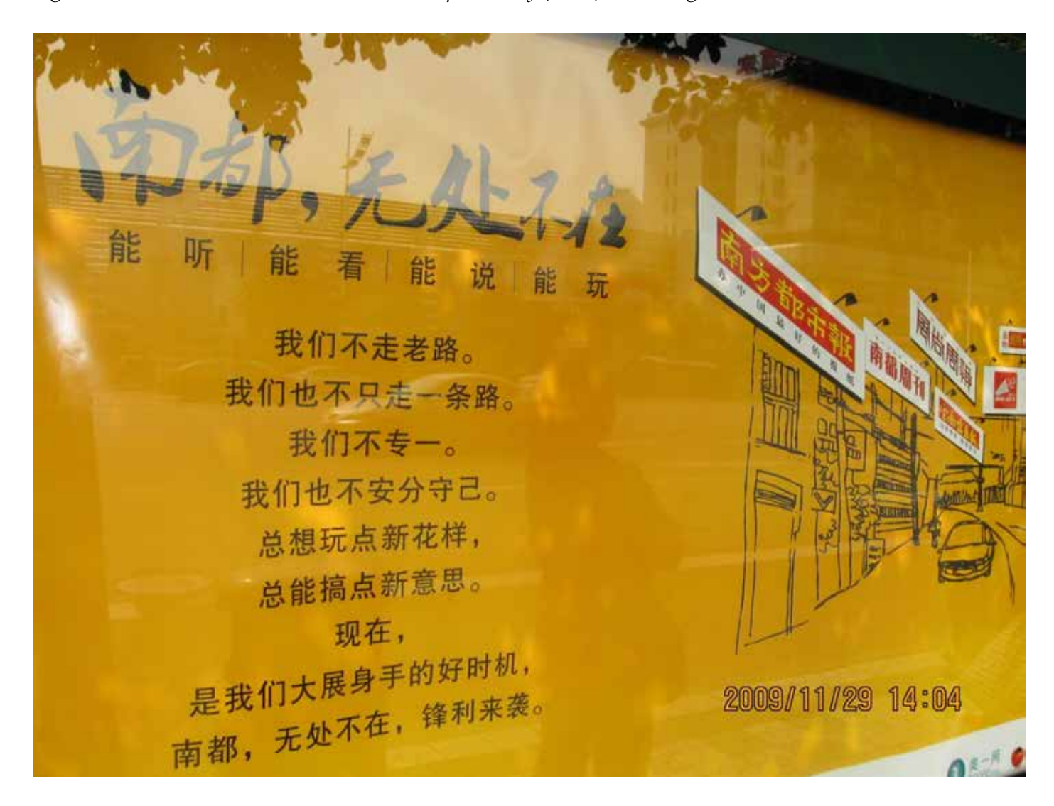
Figure 2. An advertisement of Southern Metropolis Daily (SMD) on Guangzhou street.

It reads: "SMD, omnipresent; We don't take the old road, nor do we take only one road; We are not tunnel-visioned, nor are we rule-abiding and obedient; We always want to try something new and do something different; Now, it is our time to show our talent; SMD, omnipresent, attacking, with razor sharp sword."